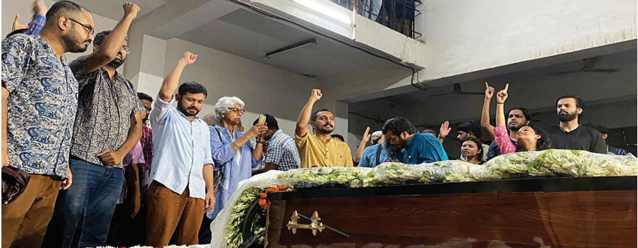
People pay their last respects to the mortal remains of Communist Party of India (Marxist) General Secretary and former JNU Students' Union President Sitaram Yechury, at Jawaharlal Nehru University in New Delhi on Friday.

“Long live comrade Sitaram Yechury” read a banner placed above the garlanded photograph of the veteran leader surrounded with the students and faculty mem-