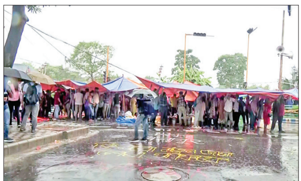
Junior doctors continue their protest against the RG Kar murder and rape case amid heavy rains, at Swasthya Bhawan in Kolkata on Friday.

The West Bengal Junior Doctors' Front (WBJDF)