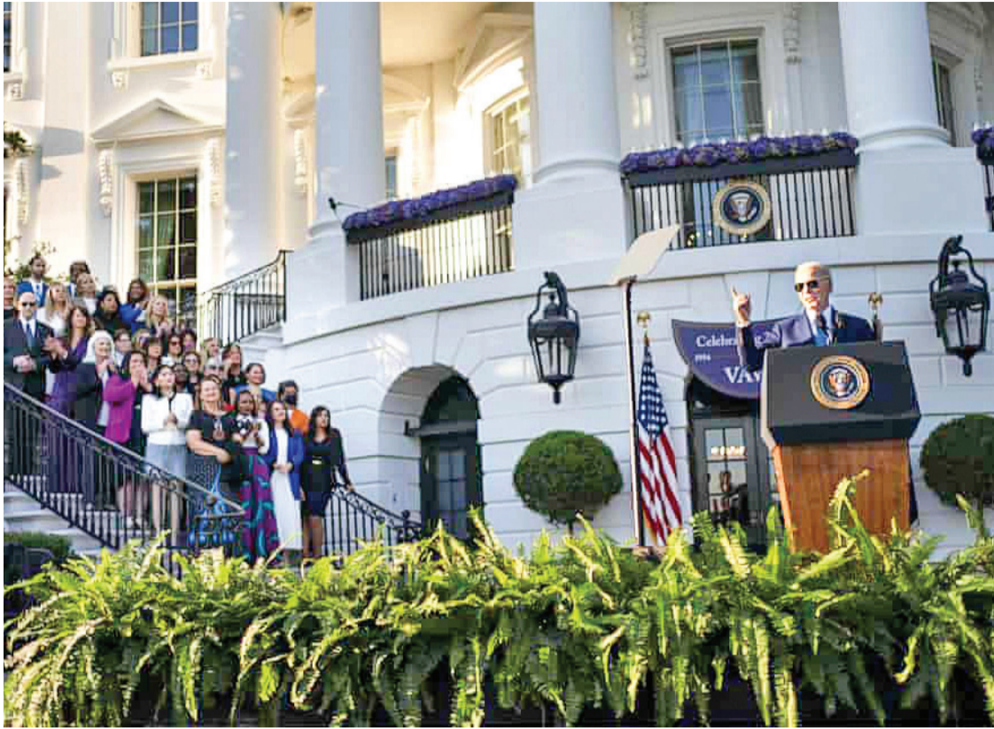
US President Joe Biden speaks during an event honouring the 30th anniversary of the Violence Against Women Act in Washington.