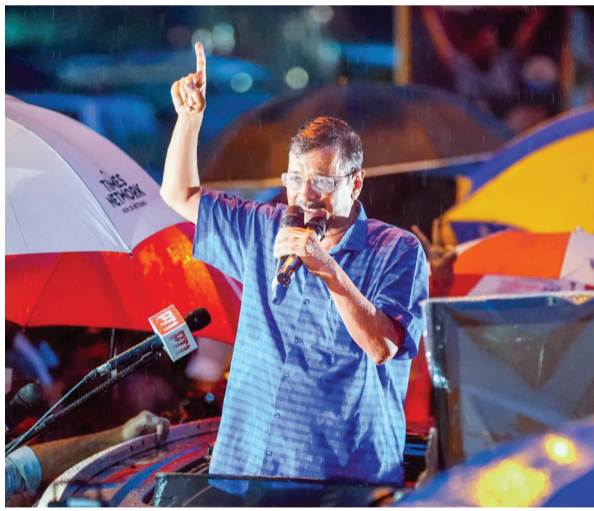
Delhi Chief Minister Arvind Kejriwal addresses the party workers after being released from Tihar Jail in New Delhi on Friday.

The top court directed Kejriwal not to make any public comment on the merits of the case and added that terms and conditions as imposed in the ED case would