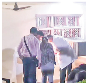
A team of CSFL inspects the spot where a suspicious explosion took place at a residence in Chandigarh.

In a significant breakthrough, the Punjab Police in joint operation with Central agencies on Friday cracked the Chandigarh grenade blast case, masterminded by ISI-backed, Pakistan-based terrorist Harwinder Singh alias Rinda of Babbar Khalsa