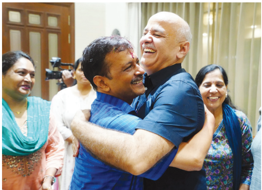
Delhi Chief Minister and AAP National Convener Arvind Kejriwal being welcomed by former Delhi Deputy Chief Minister and party leader Manish Sisodia as he arrives at his residence after being released from Tihar Jail on interim bail in New Delhi on Friday.

The chief minister, who was arrested on March 21 by the Enforcement Directorate (ED) in a money-laundering case linked to the excise policy and then