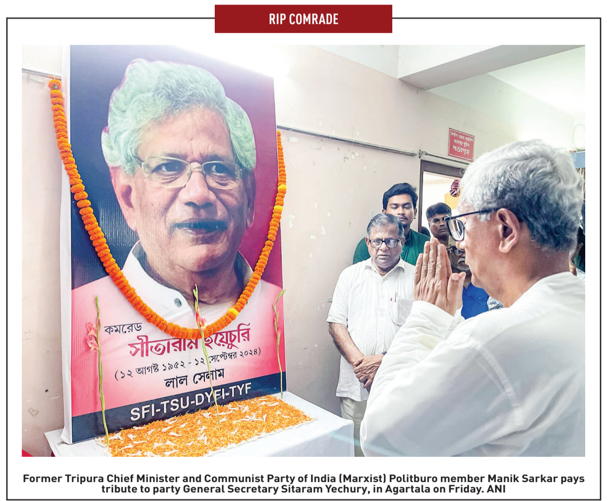
Former Tripura Chief Minister and Communist Party of India (Marxist) Politburo member Manik Sarkar pays tribute to party General Secretary Sitaram Yechury, in Agartala on Friday.