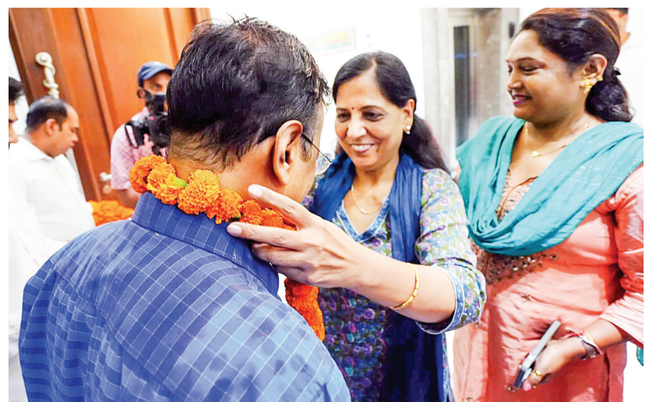
Arvind Kejriwal being welcomed at his residence