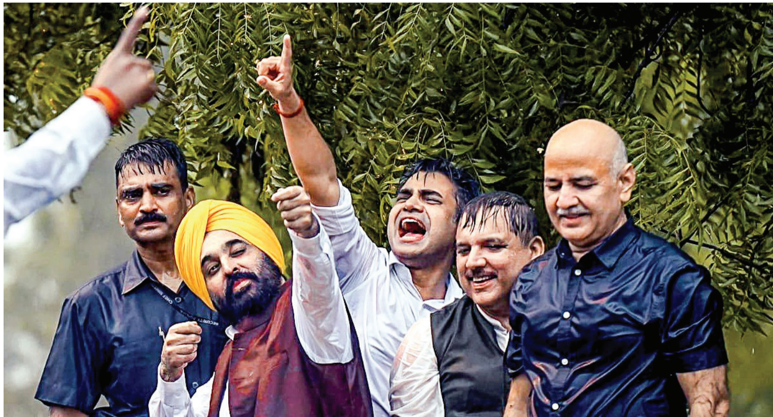
AAP leaders and workers celebrate the release of Delhi CM Arvind Kejriwal

Allegations of favouritism and corruption: There were accusations that the Delhi Excise Policy of 2021