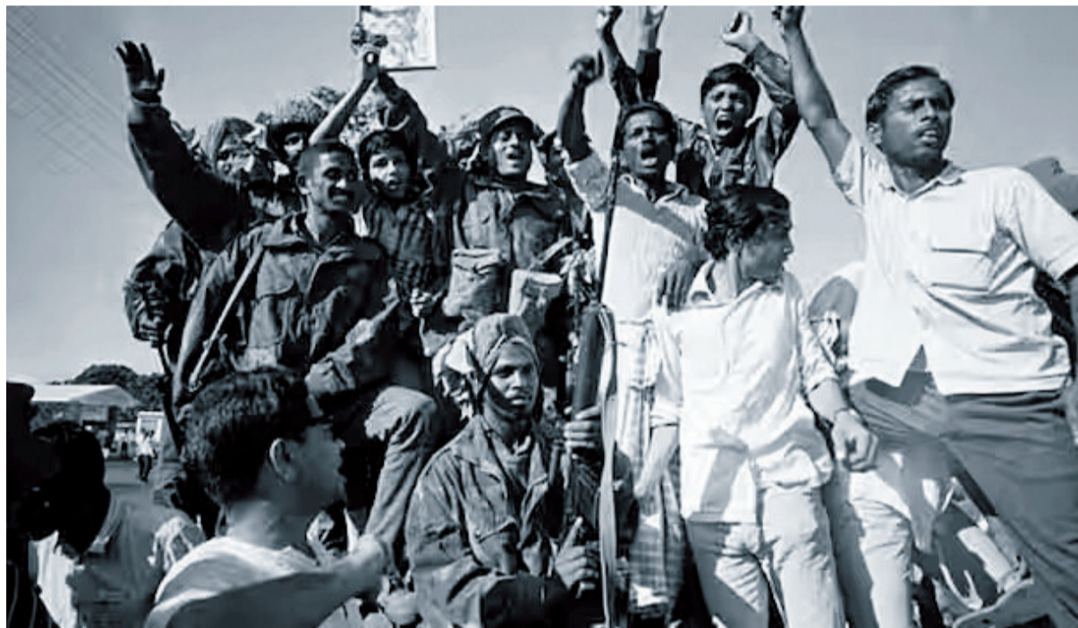
Indian troops hailed as liberators as they enter Dhaka, East Pakistan, during India and Pakistan's third major conflict. File photo