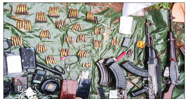
Arms and ammunition recovered from Maoists during an encounter in Bhadradi Kothagudem on Thursday.

Despite repeated appeals for surrender, the Maoists ignored the warnings, prompting the police to