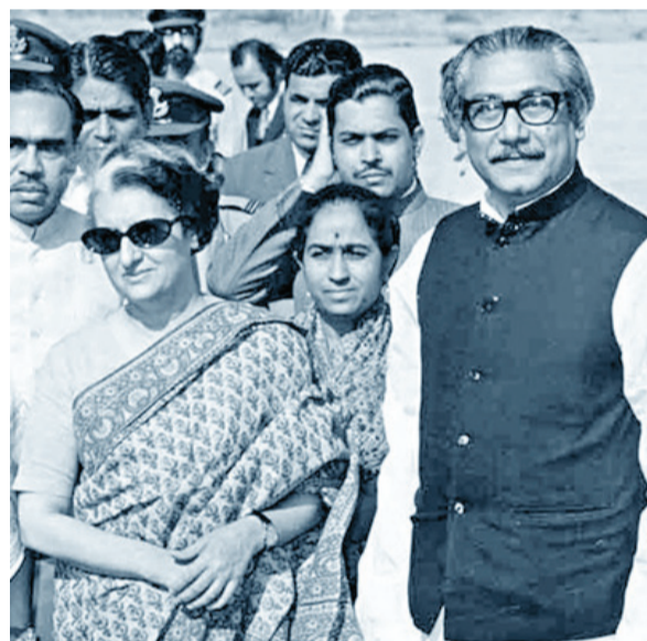
The two Prime Ministers: Indira Gandhi of India and Sheikh Mujibur Rahman of Bangladesh. File photo

India played a pivotal role in the formation of Bangladesh in 1971, providing critical support that encompassed diplomatic efforts, humanitarian assistance,