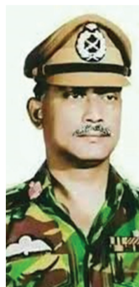
Ziaur Rahman. File photo

the Bengali liberation forces, by providing training, arms, and strategic guidance. The Indian military established training camps and facilitated the organization of guerrilla warfare tactics, enhancing the operational effectiveness of the Mukti Bahini against Pakistani forces. This collaboration intensified the insurgency efforts within East Pakistan, destabilizing Pakistani military operations.