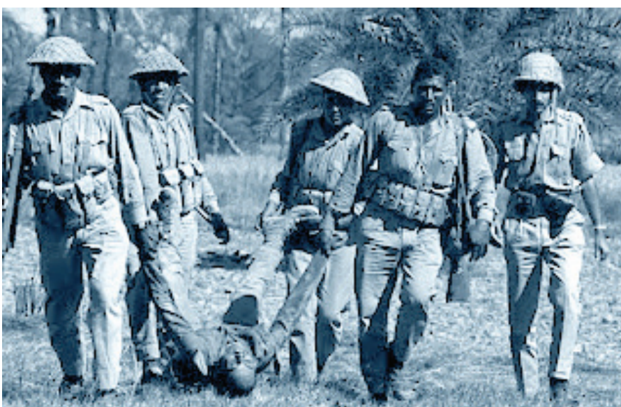
Remembering the Bangladesh Liberation War: The struggle for Independence and the atrocities of 1971. https://historyandmystery.blogspot.com/

India extended substantial support to the Mukti Bahini,