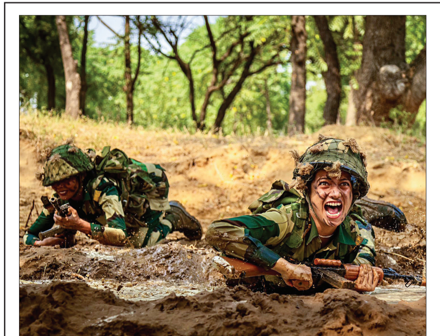
Home minister Amit Shah posted this pictures on his X handle to greet the Border Security Force (BSF) on its 60th Raising Day, on Sunday.