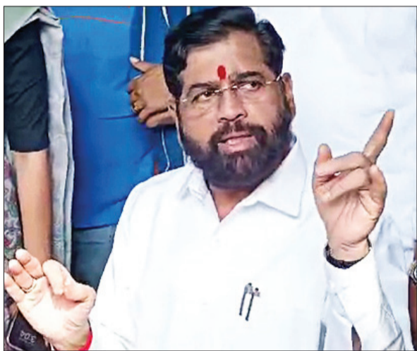
Maharashtra caretaker CM Eknath Shinde addresses a press conference, in Satara on Sunday.

Earlier in the day, outgoing Chief Minister Eknath Shinde said he would support the BJP's decision to pick the new chief minister. "The name of Devendra Fadnavis has been finalised as the new chief minister of Maharashtra. The meeting to elect the new BJP legislature party meeting will be held on either December 2 or 3," a news agency quoted a BJP leader as saying.