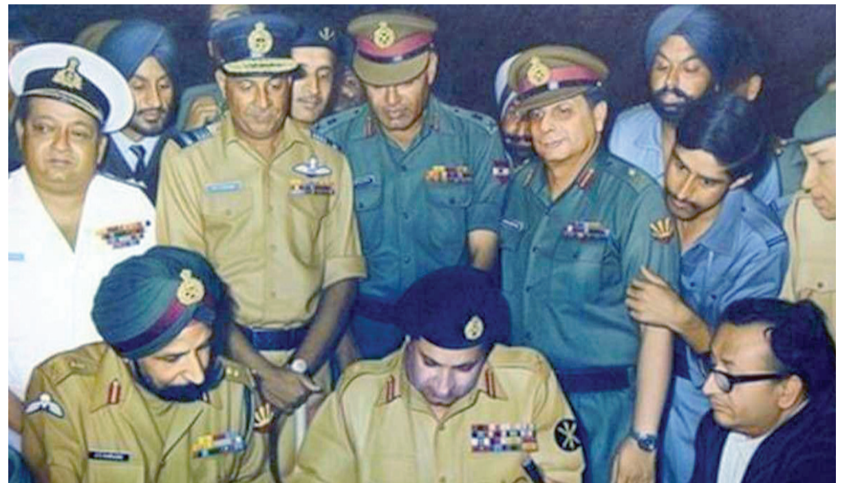
The Pakistani Instrument of Surrender.

Bangladesh's journey to independence is a compelling narrative of cultural identity, political struggle, and resilience. The nation's path to sovereignty was shaped by a series of pivotal events, culminating in its emergence as an independent country in 1971.