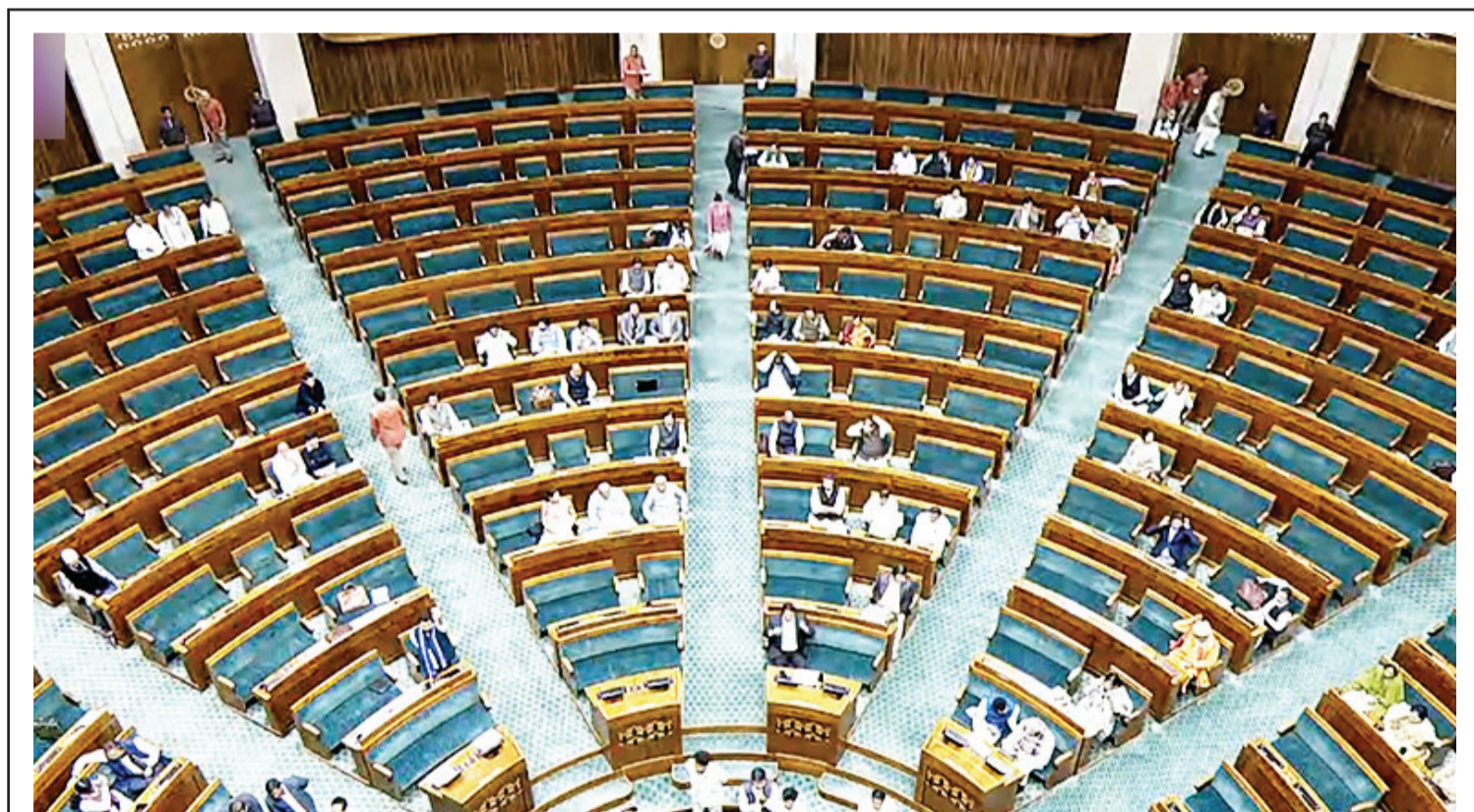
Lok Sabha proceedings underway during the Winter Session of Parliament, in New Delhi on Friday.

beginning of the Winter Session amid protests by opposition parties over the Adani issue and violence in Manipur and Sambhal. Rajya Sabha Chairman and Vice President Jagdeep Dhankhar said that the actions are not "public-centric." "This cannot be appreciated. We have become a laughing stock, and parliament disruptions are in public distaste. We are creating a very bad precedent. Our actions are not public-centric. We are getting into irrelevance. Rule 267 is being weaponised as a tool of disruption," the Rajya Sabha Chairman said. The Chairman expressed his deep anguish and profound regret at the disruption in the normal business of the House. Opposition members have been continuously pushing to have a discussion on the floor on the Adani issue, Sambhal violence and the Manipur situation, raising slogans in the Parliament.