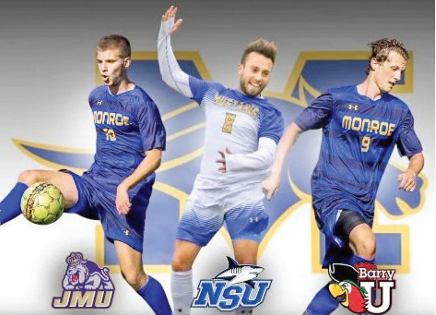
Unlike India’s government-led model, the U.S. relies on decentralized college and club sports. NCAA universities produced 75% of its 2020 Olympians and 82% of medalists. warubi-sports