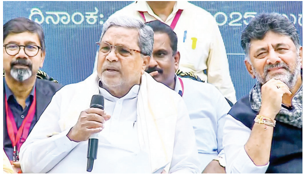
Karnataka Chief Minister Siddaramaiah and state Deputy Chief Minister DK Shivakumar address the media after state Cabinet meeting, in Chikkaballapur on Wednesday.