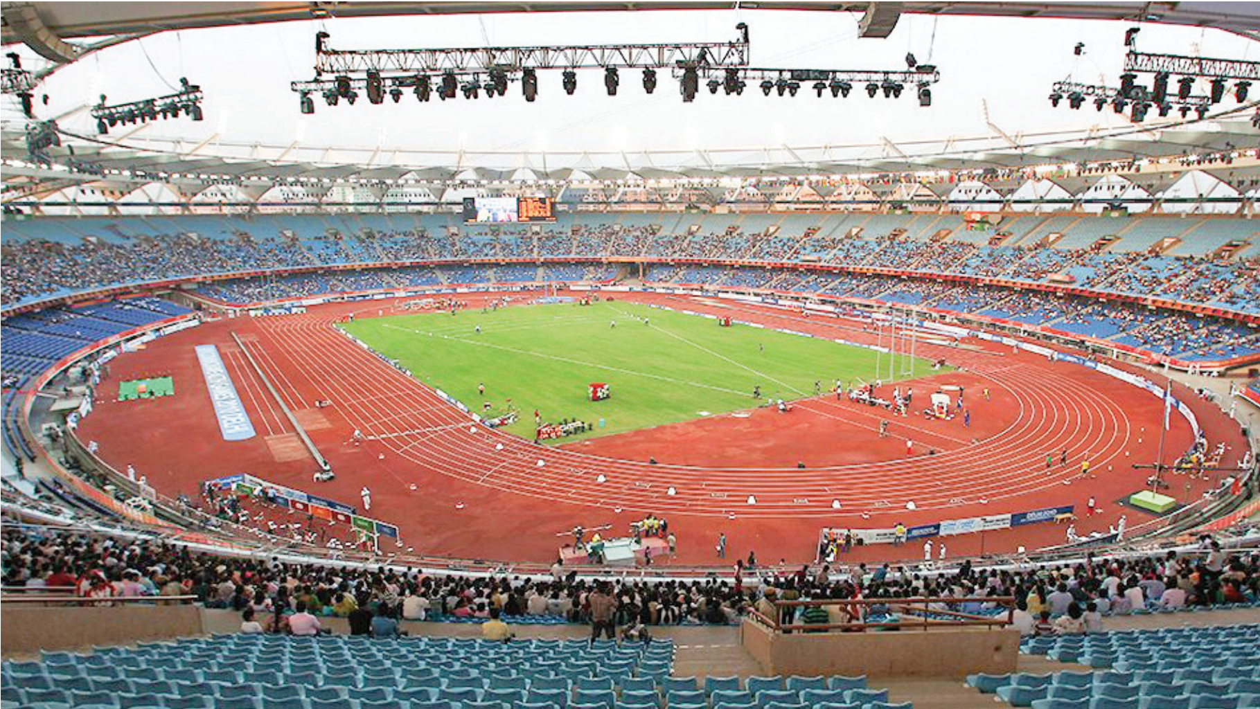
New Delhi will welcome the world’s best para-athletes next year, as India holds the championships for the first time. athleticsweekly

2036 Olympics. And above all, there’s ambition—rooted in geopolitics, youth policy, and soft power. But is this truly a turning point—or merely the latest chapter in a long history of missed podiums and policy déjà vu? Prime Minister Narendra Modi announced on July 1, 2025, that the Union Cabinet had approved the National Sports Policy 2025 ( Khelo Bharat Niti ), it was heralded as a “landmark day” for Indian sports. Promising to turn India into a “global sporting powerhouse,” the policy outlines five foundational pillars: excellence, economy, social inclusion, mass participation, and integration with education . But is this a revolution—or a repackaged version of past dreams? India’s tryst with sporting policy began in the 1950s when Prime Minister Jawaharlal Nehru saw sport as part of nation-building. The All-India Council of Sports (1954) was created to advise on national programs, though funding was minimal. While India dominated Olympic hockey (six golds from 1928–1956), success in other sports was scarce. The 1982 Asian Games under Indira Gandhi