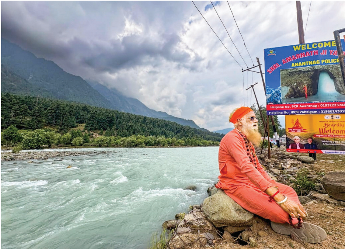
A pilgrim sits on the banks of the Liddar river at Nunwan base camp at Pahalgam, during the annual 'Amarnath Yatra', in Anantnag district, Jammu and Kashmir.