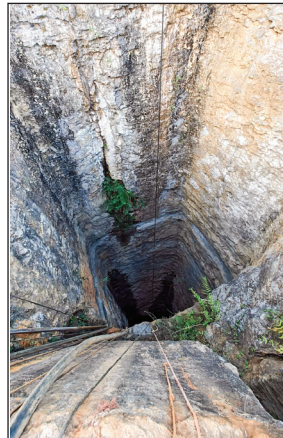
An overhead view of the Umrangso coal mine, where the labourers got trapped following a sudden gush of water that flooded the site, in Dima Hasao in January.

This growth is a result of improved operational effi-