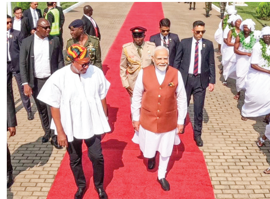
Prime Minister Narendra Modi receives a warm welcome by Ghana President John Mahama on his arrival at Kotoka International Airport in Accra, Ghana on Wednesday.

Ghana is a valued partner in the Global South and plays an important