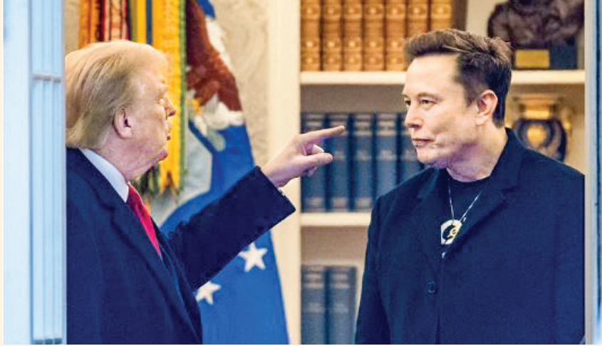
In this photo from March 14, 2025, US President Donald Trump and Elon Musk (R) speak in the Oval Office before departing the White House in Washington, DC. File Photo

The already turbulent relationship between former U.S. President Donald Trump and Tesla CEO Elon Musk appears to have escalated to new heights. In a recent media interaction, Trump made veiled threats toward Musk, suggesting that the billionaire tech mogul might “lose a lot more” than just federal subsidies if he continues to challenge the administration's stance. The remarks have sparked widespread speculation and concern, with some wondering: could Donald Trump actually deport Elon Musk?