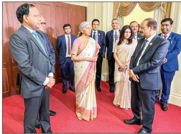
Nirmala Sitharaman during the centenary celebration of SBI Mumbai main branch building, in Mumbai in November 2024. SBI Chairman Challa Sreenivasulu Setty and DFS Secy Nagaraju Maddirala are also seen.

This means India accounted for nearly 7 per cent of the total rise in the global economy, showing its growing importance and strength as one of the leading contributors to global growth.