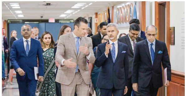
External Affairs Minister S. Jaishankar and U.S. Secretary of Defence Pete Hegseth meet in Washington DC on July 1, 2025.

Hegseth also expressed satisfaction with the successful integration of U.S. defense equipment into India's military inventory. Building on this progress,