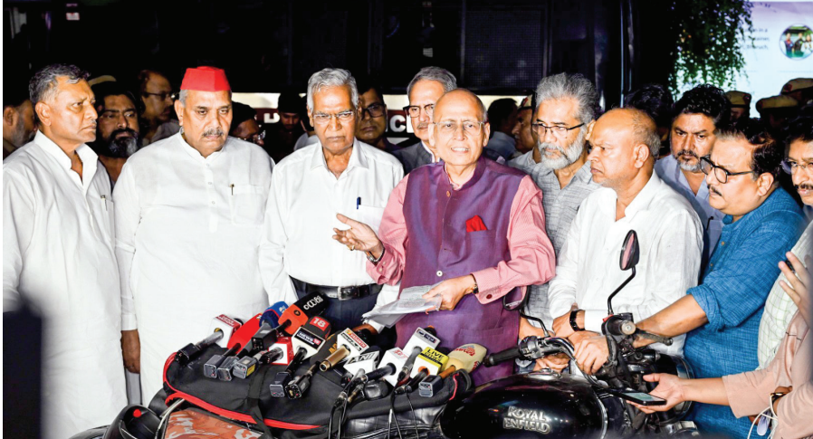
Congress leader Abhishek Manu Singhvi, flanked by other I.N.D.I.A bloc leaders, addresses a press briefing after the meeting with Election Commission of India, in New Delhi on Wednesday.

Leaders from 11 parties, including the Congress, RJD, CPI(M), CPI, CPI(ML) Liberation, NCP-SP and Samajwadi Party met Chief Election Commissioner Gyanesh Kumar and other Election Commissioners, objecting to the special scrutiny being conducted just a few months ahead of the assembly elections in Bihar.