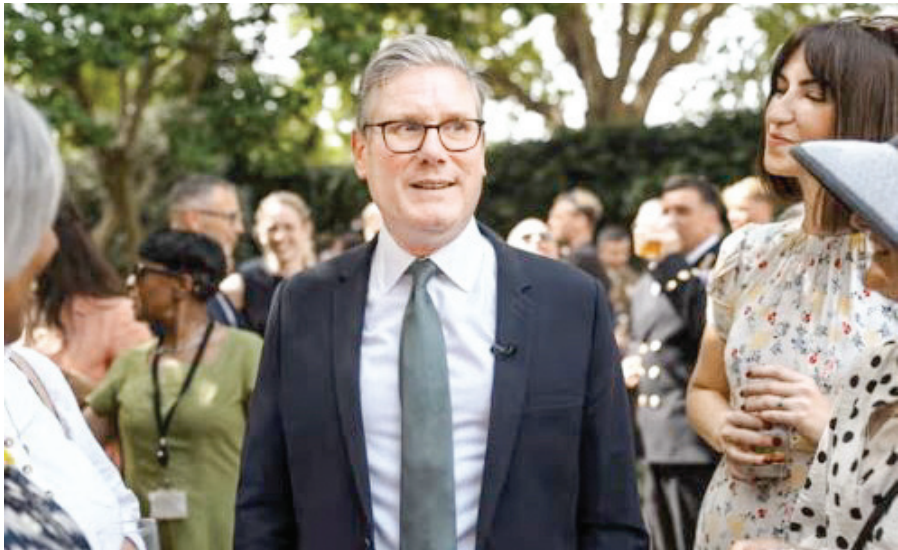
Keir Starmer at a reception for public sector workers, Downing Street, London, 1 July 2025.

In the often unforgiving world of politics, when leaders begin to lose ground, they rarely admit outright defeat. Instead, they speak of listening, of understanding, of addressing concerns — all carefully crafted phrases designed to convey responsiveness without acknowledging failure. “Your anger has been heard,” says the contrite minister in the wake of a humiliating by-election result. “We are addressing the concerns,” pledges the government spokesperson on the eve of a backbench rebellion. Yet, by the time these words are uttered, it is frequently too late to avert damage. Such is the case for the Labour government's handling of its internal dissent over proposed disability