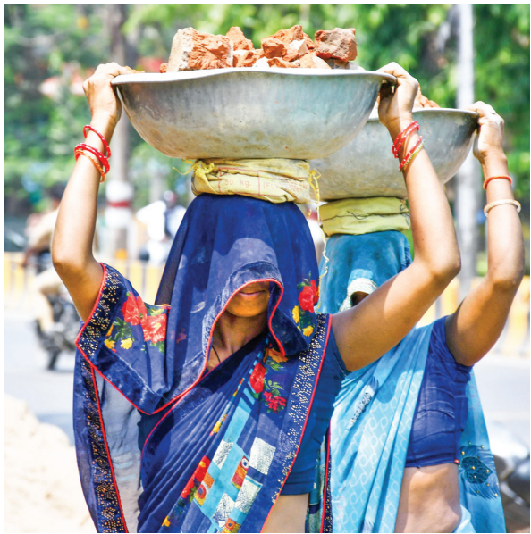
Labourers carry bricks on the occasion of International Labour Day, in Prayagraj on May 1.

While India has offered to reduce its Most Favoured Nation (MFN) duties on US goods as part of the deal, Washington appears un-