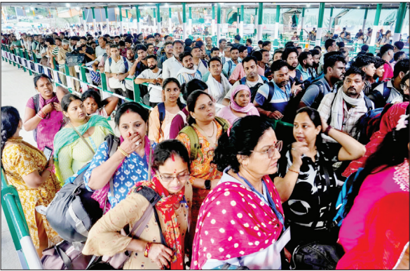
Anantnag: Amarnath bound pilgrims arrive at the Nunwan Base Camp, at Pahalgam in Anantnag, J&K.

Officials said the first convoy comprised 5,892 pilgrims, including 1,115 women, 31 children, and 16 transgenders, who departed from Jammu around 4:30 a.m. for the base camps in the Kashmir valley. The pilgrimage will conclude