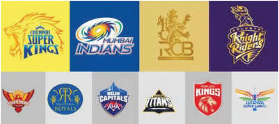
CSK, MI, RCB, and KKR-have exceeded $100 million in brand value for the first time.

India’s bold 2025 sports policy aims to turn grassroots grit into Olympic gold—merging nationalism, education, and economy in a historic play for global sporting power.