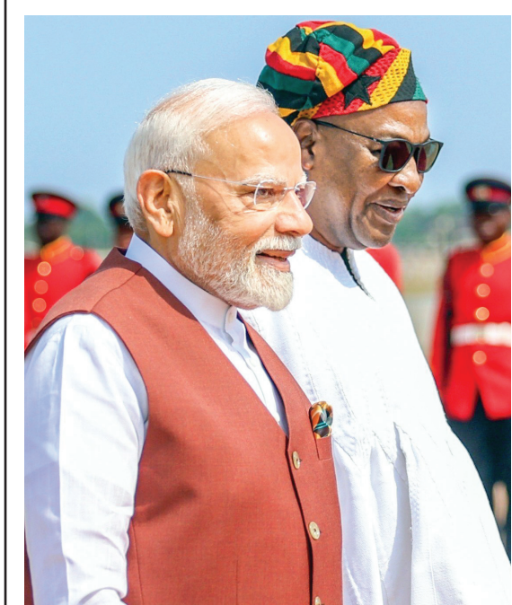
PM Modi receives a warm welcome from Ghana President John Mahama on his arrival at Ghana, for his first-ever bilateral visit.