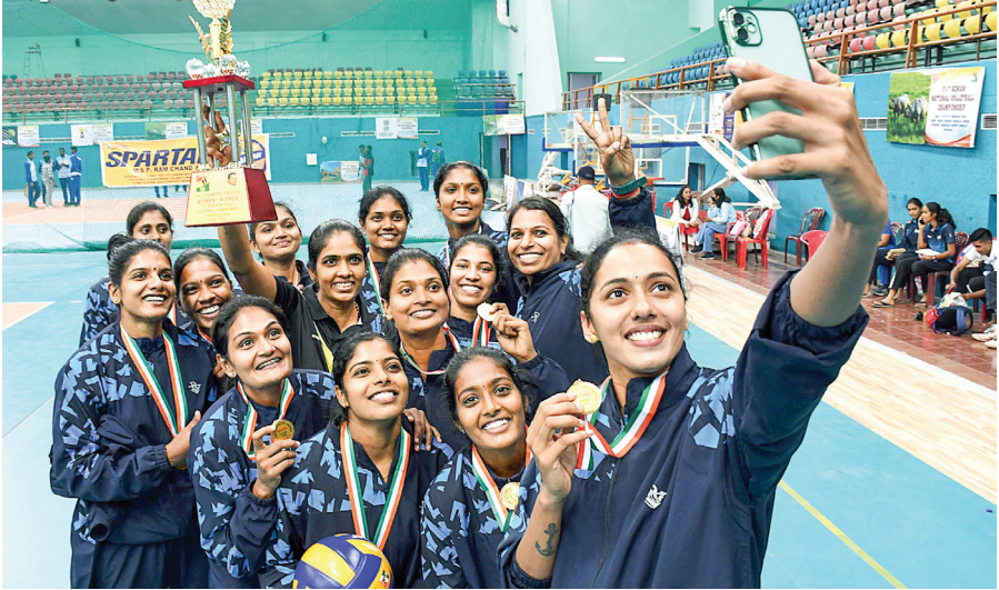
Players of Kerala Women Volleyball win the finals of the 71st Senior National Volleyball Championship (women) against Railways on February 10, 2023.

marked a significant inflection point, prompting the launch of India’s first National Sports Policy in 1984 . That era saw the founding of the Sports Authority of India (SAI) , aimed at talent identification and infrastructure. However, the lack of a long-