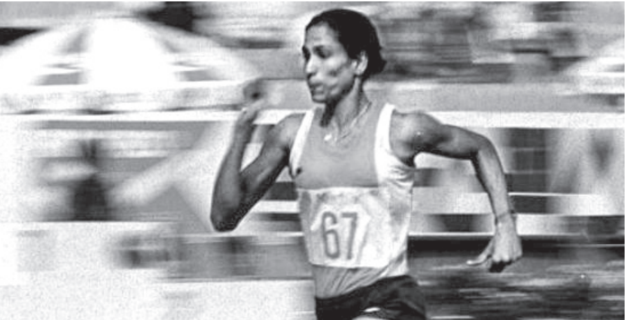
PT Usha’s haul at the 1985 Asian Championships carved a golden legacy. India have hosted the Asian Games twice, including the inaugural edition in 1951.

Despite all the promises, infrastructure gaps, federation politics, and social inequalities remain hurdles. Grassroots athletes continue to lack: ● Access to quality coaching ● Adequate nutrition and medical care ● Safe playgrounds in urban slums and rural zones The success of NSP 2025 , like its predecessors, will depend not on intentions but implementation and accountability . The proposed National Sports Board could be transformative—if insulated from political meddling.