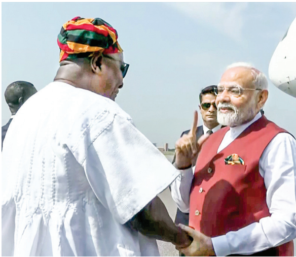
Prime Minister Narendra Modi receives a warm welcome by Ghana President John Mahama on his arrival at Kotoka International Airport in Accra, Ghana, for his first-ever bilateral visit to the country, on Wednesday. PM Modi becomes the first Indian PM to visit Ghana after 30 years.

This mineral diplomacy is being executed with finesse—partnering rather than extracting, building capacity rather than exploiting. Bharat’s engagements are increasingly accompanied by offers of education, training, environmental standards, and infrastructure investments,