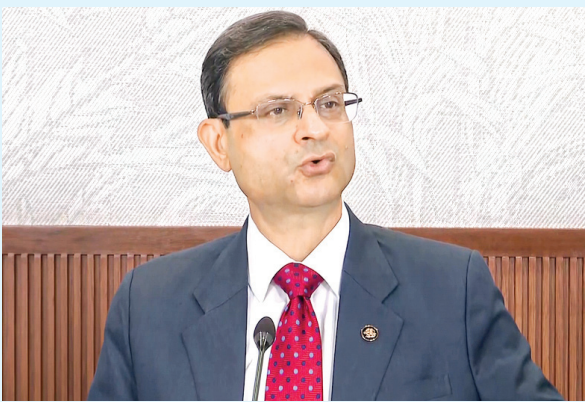
RBI Governor Sanjay Malhotra makes a statement on RBI Monetary Policy during the 54th MPC held from 7 to 9 April, in Mumbai on Wednesday.

It stated, “Overall, the financial year has taken off on a promising note from the perspective of the government’s contribution to growth dynamics”.